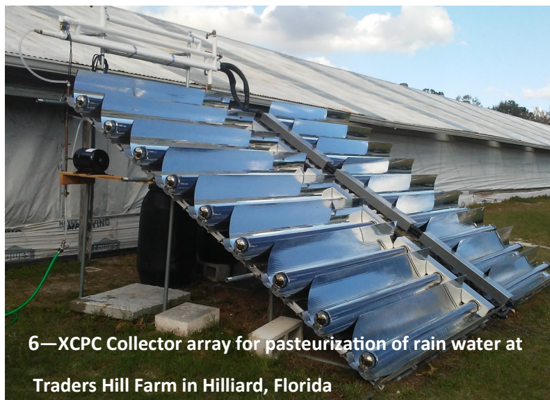
6—XCPC Collector array for pasteurization of rain water at Traders Hill Farm in Hilliard, Florida